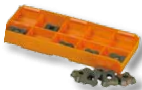
Art. Nr. 26109