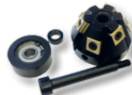
Art. Nr. 27223