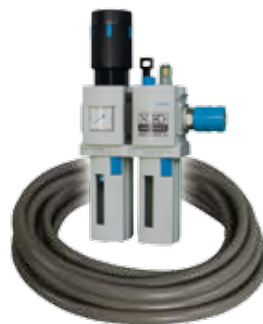
Art. Nr. 27221