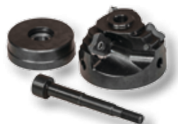
Art. Nr. 27234