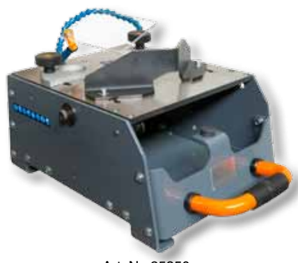
Art. Nr. 25350