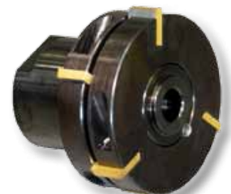
Art. Nr. 29202