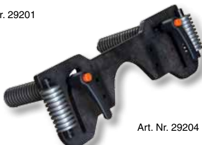
Art. Nr. 29204