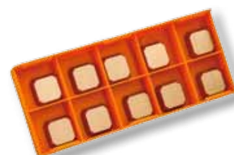
Art. Nr. 29203