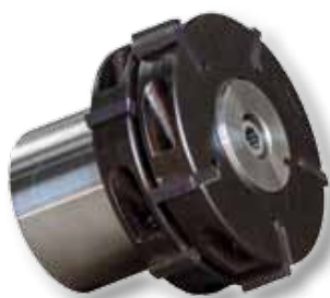
Art. Nr. 29201