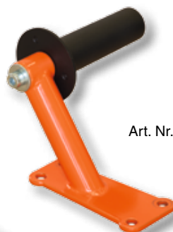
Art. Nr. 29206